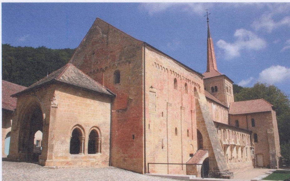
Priory church of Romainmôtier

Romainmôtier, a village of 460 souls, lies some 20 km north of Lake Geneva in the foothills of the Jura mountains, close to the French border. Little does one expect to find one of the oldest churches of Switzerland there. Romainmôtier comes with a big history, tied up intricately with the churches and politics of France.