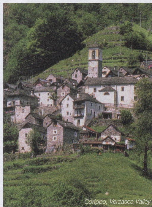
Corippo, Verzasca Valley

Lavertezzo lies on a marvellous stretch of the River Verzasca, with clean, intensively green waters gushing between bizarrely eroded rocks. The bridge in the village of Lavertezzo, is a popular destination for bathers and divers. It is often falsely called "The Roman Bridge" since its architecture with two arches only goes back as far as the Romanesque period in the 17th century. This stunning bridge is the starting point of various stunning mountain walks. UN