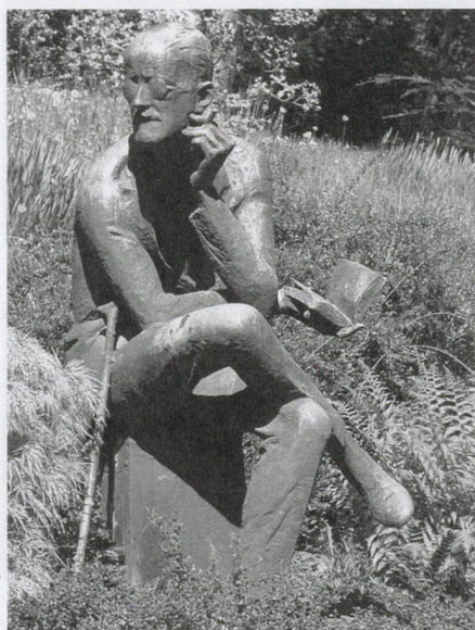
James Joyce's grave site