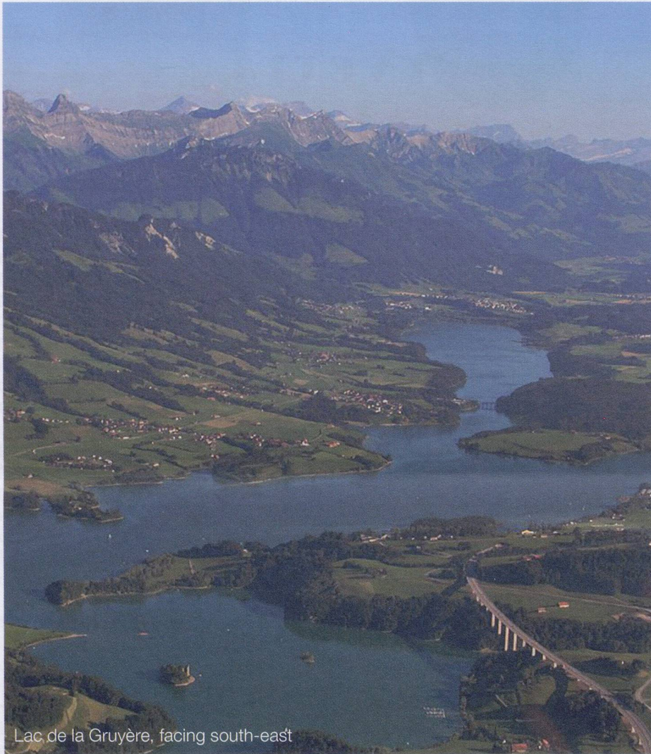
Lac de la Gruyère, facing south-east

The natural beauty and human history of the La Gruyère region, from the Lac de la Gruyère and its many tributaries, into the hills and pre-alps, offers plenty to experience for discovery and tramping.