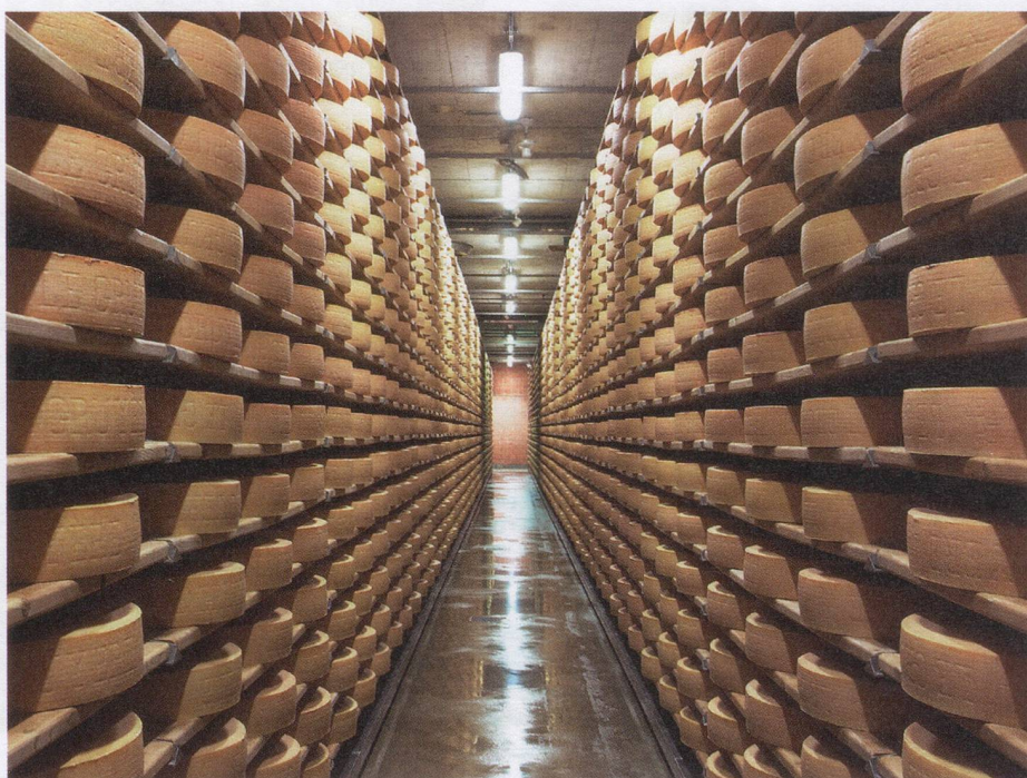
Gruyère cheese curing away in large quantities

www.la-gruyere.ch Photo © Le Maison Gruyère