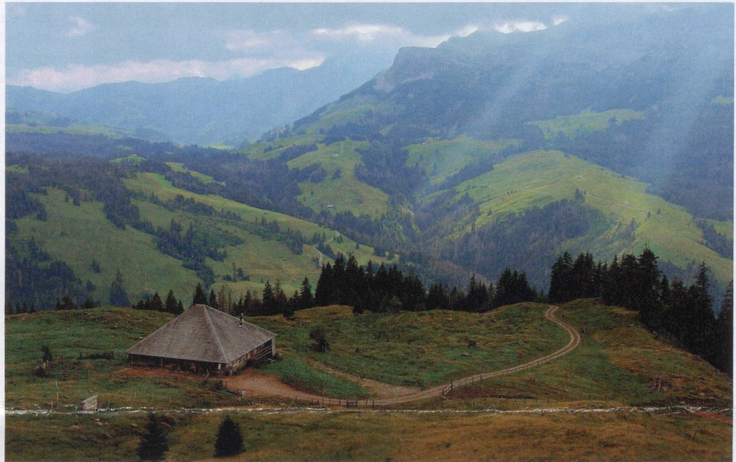
View from the Mittlist Gfäll Alp to Schrattenflue and Chemmeribodenflue in the Entlebuch region