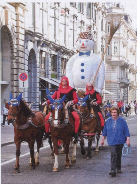
The Böögg and his henchmen

Sources: http://en.wikipedia.org/wiki/B%C3%B6%C3%B6gg http://www.sechselaeuten.ch/sechselaeuten/festablauf.asp For more nice snap shoots go to http://www.schweiz-foto.ch/Zuerich/Zuerich_Sechselaeuten/Bilder.php