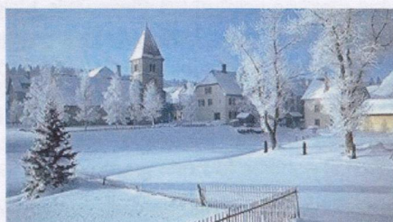
La Brévine, Neuchâtel Jura www.myswitzerland.com