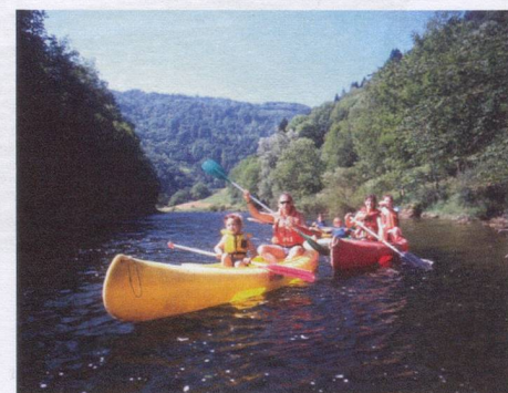
Kayaking on the Doubs River