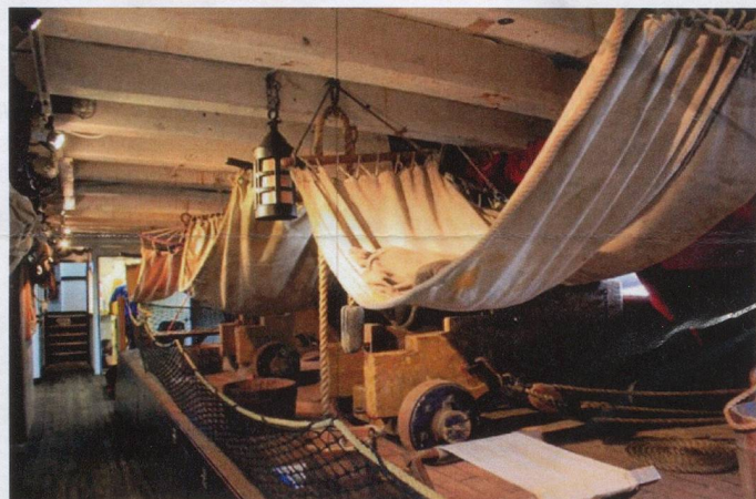
Sleeping quarters directly over the cannons!