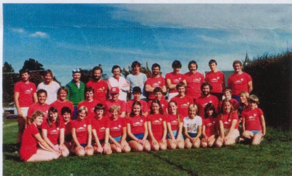
Soccer Tournament in Kaponga and "Top 10" competition

The Auckland Swiss Club was founded on Tuesday, 3rd November 1956. In January 1957, the first ever picnic was held together with the Waikato Club in the Bombay Hills. On that day, the first inter-club competitions were introduced, a tradition that has been kept up for almost 60 years now.