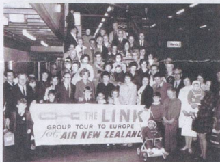
First group travel to Switzerland in 1964