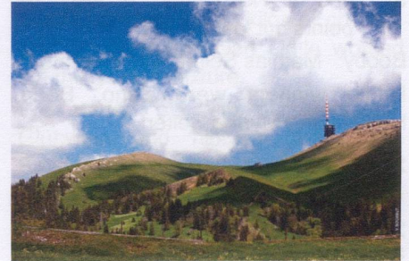
Mount Chasseral