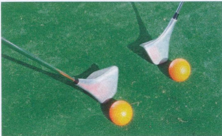
Swin golf clubs www.myswitzerland.com

http://www.neuchatel-tourisme.ch/en/leisure-activities/fun-co/