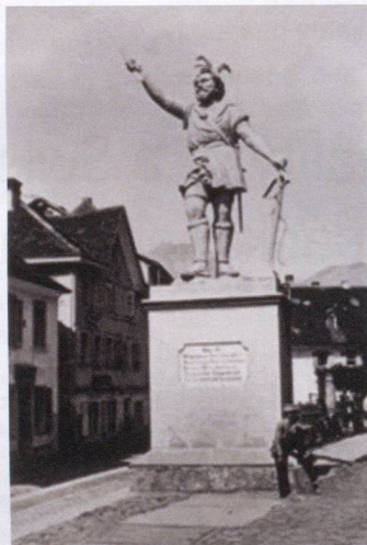
Gottfried Siegfried's Tell statue