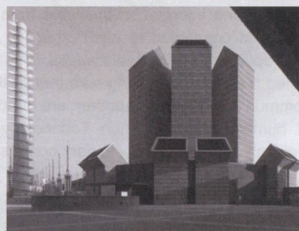
Church of Santo Volto, Turin, Italy