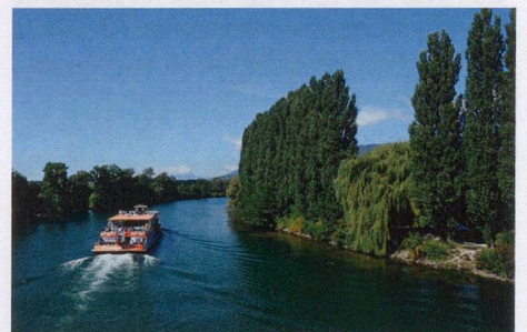
Zihlkanal by boat