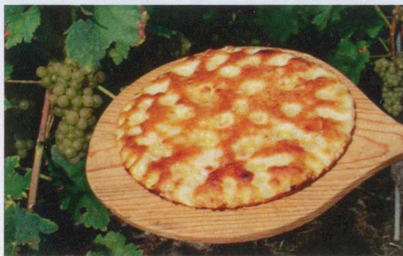
Delicious Gâteau de Vully (Recipe page 21) www.murtenantourismus.ch

Fritz: Freshly caught fish and for dessert, not to be missing, a nice slice of Gâteau de Vully (a kind of cream cake).