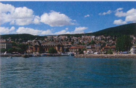
The City of Neuchâtel www.bielersee.ch