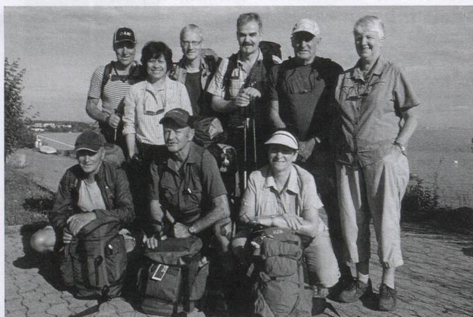
Group at Rorschach: