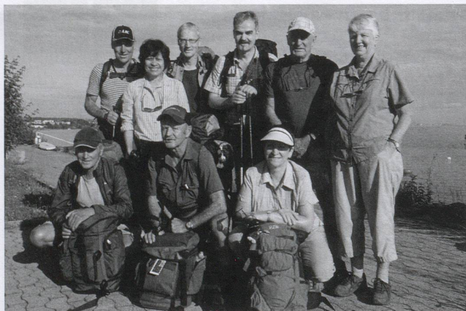
Group at Rorschach: