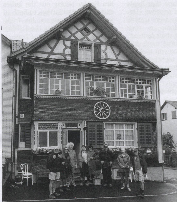
Outside our 200 year old B & B, Einsiedeln

DAY 4: Tuggen - Lachen - Einsiedeln: The weather continued to be hot. Rae's blisters prevented her from wearing walking shoes so she opted to spend the day with Beni walking the easy track around Wägitalersee. The rest of the group settled into a walking rhythm through the lush green rolling countryside dotted with small villages and towns like Lachen - just like the chocolate box pictures. We arrived at St Meinrad chapel and restaurant