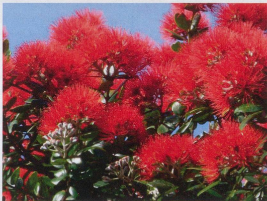
Pohutukawa - New Zealand Christmas tree

However, it is the Christ Child who brings presents on Christmas Eve. Many of us remember waiting behind closed doors on Christmas Eve with baited breaths, until a bell tinkled. This was the sign that Christ Child had come: we ran into the living room, hoping to catch a glimpse of Christ Child as it slipped through the window – only to find a beautifully decorated and a Christmas tree lit with real candles, with a few presents underneath it. Dark winter nights meant that lights were off and the candles and decorations seemed all that more magical. Christmas generally was a small, family-based affair. (cont. p2)