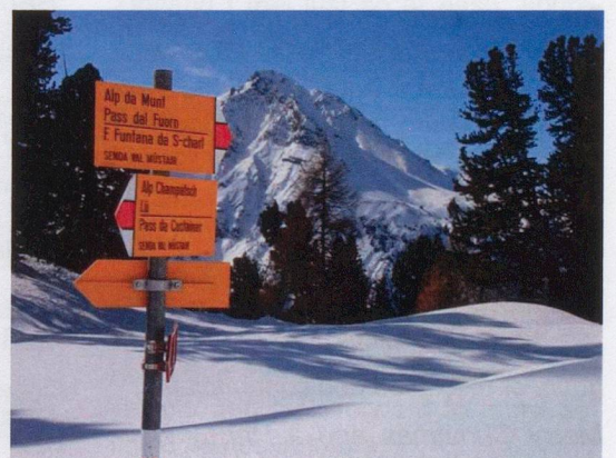
Winter landscape, Val Müstair, Switzerland