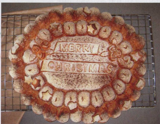
Swiss Bakery Christmas bread