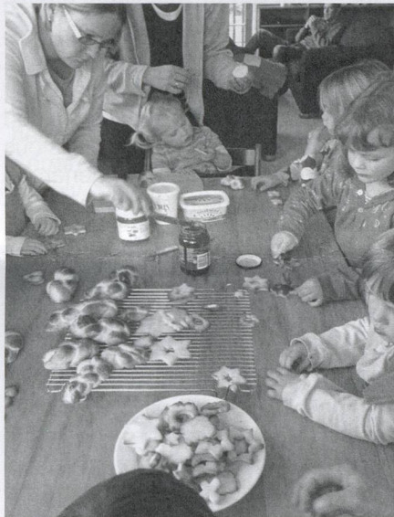
Making Zöpfe and Guetzli