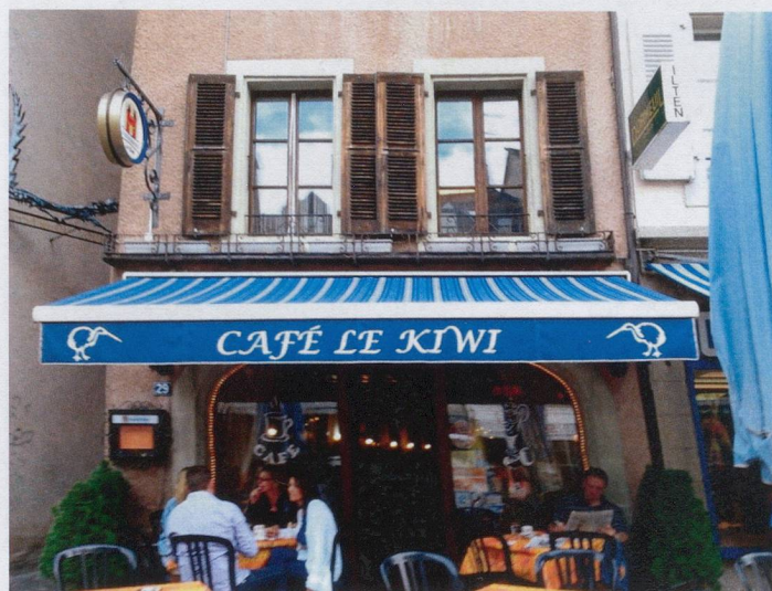
„Café Le Kiwi“ in Morges