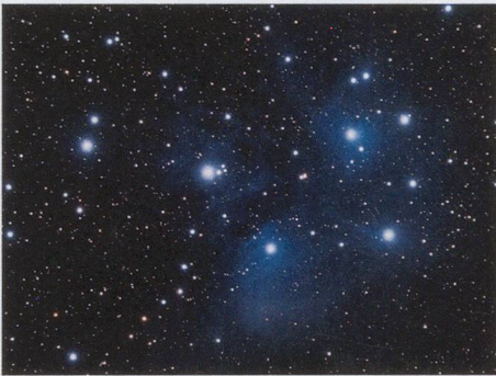
Matariki (the Pleiades) star cluster

Whether you call it midwinter solstice or Matariki, these short cold days are perfect for a celebration; invite a few friends to some traditional Swiss comfort food, be it a Minestrone you can eat with a fork, or a fondue, or a raclette, or some Rotkraut... And enjoy the fact that the days are getting longer again, even if you don't notice yet..