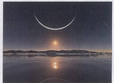
December 2010 northern solstice with an almost total eclipse of the moon

to a stop before reversing direction. The solstices, together with the equinoxes, are connected with the seasons. In many cultures the solstices mark either the beginning or the midpoint of winter and summer.