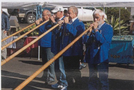
They look and sound good