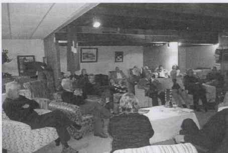
A very comfortable AGM meeting