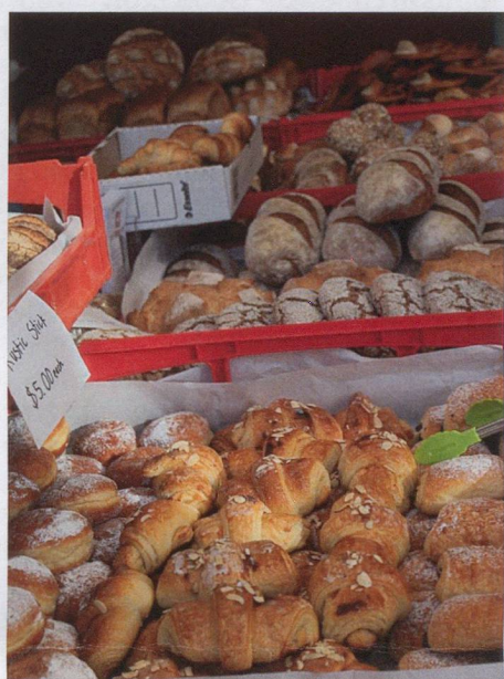
Mouthwatering pastries and breads