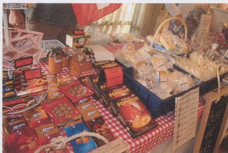
What a choice!

On a personal note, my second hand bookstand gave me many opportunities to chat to