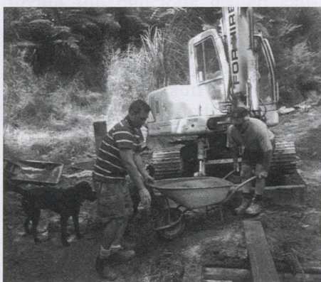
Bridge repairs Swiss farm

The bridge between the shooting hut and the butts suffered in the big downpour. We couldn't use the bridge anymore (safely). Henry called an emergency working bee. A total of 19 people offered their help and a lot got done on a day where everyone was on storm alert from the weathermen. Auckland got high winds and a few passing showers, but we didn't get the bad weather that our friends further down on the North Island suffered.