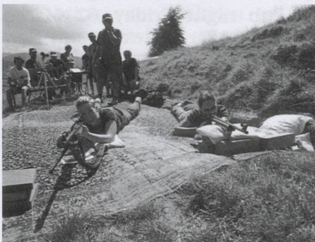
In the footsteps of William Tell?

Our shooting event went very well again this year with 20 par-