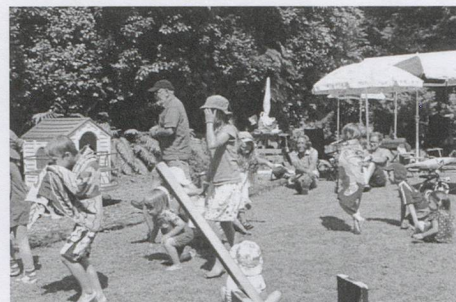
The rush to the treasure hunt

preciated distribution of ice-creams. Some quick adults were able to snatch some too.