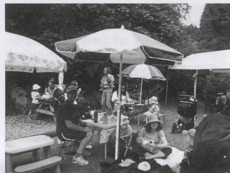
A lovely way to spend a Sunday afternoon

We had the visit of a neighbour's little dog, who seemed very excited by such a friendly crowd!