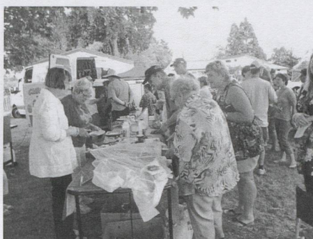
Nobody had to be hungry

day was had by all. There seemed to be many visitors from Switzerland and also lots of new young families. Some people said they remember coming along to the picnic 30 or 40 years ago and had never been back so it was a bit of a trip down memory lane, although the venue was different.