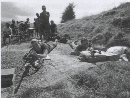
In the footsteps of William Tell?

Our shooting event went very well again this year with 20 par-