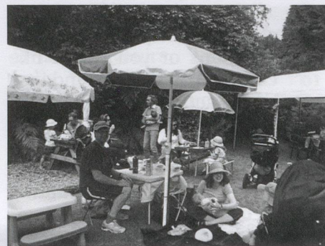
A lovely way to spend a Sunday afternoon

We had the visit of a neighbour's little dog, who seemed very excited by such a friendly crowd!