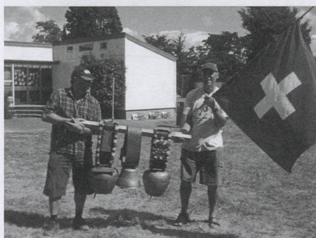
Showing off the cowbells...

Annual Picnic held Sunday 19 th February at the Newstead School near Hamilton. Again, what an amazing day, considering all the miserable weather we had before and after the event. We managed to set nearly everything up under the big oak trees including the bowling alleys. It wasn't long before people arrived and many started lining up at the bowling alleys to try their luck at the medals, sausage or trophy bowling.