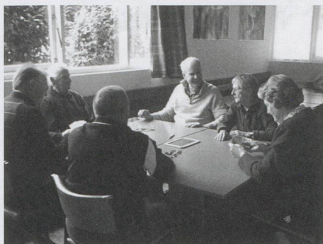
A game full of surprises!

ing with six players and two sets of cards. The two teams of three excellent players each quickly adapted to the new form, and we had a great afternoon. Two players had to leave early, around 4pm, and the remaining four players then had a more traditional game, which was fun, too.