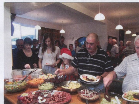
People queuing up for Christmas dinner