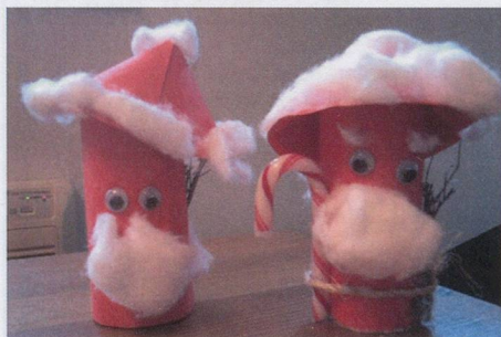
The little ones are just as friendly as the real ones...

On Sunday 4 th December Samichlaus visited the Wellington Club House. The children were busy crafting little Samichlaus