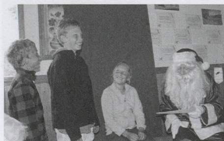
They must be exceptionally good children - all smiles!