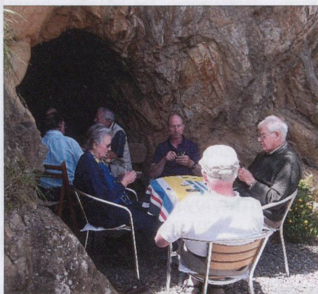
Jassers in Trudi's cave

Well, that's what was announced in our program, but as our toilets were not quite ready yet, it had to be modified to "Jassen with Coffee and Cake in the Cave". Eight keen Jassers