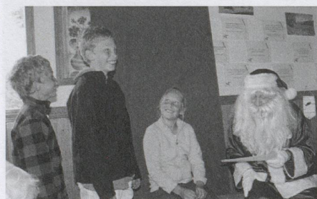
They must be exceptionally good children - all smiles!