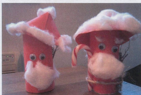
The little ones are just as friendly as the real ones...

On Sunday 4 th December Samichlaus visited the Wellington Club House. The children were busy crafting little Samichlaus