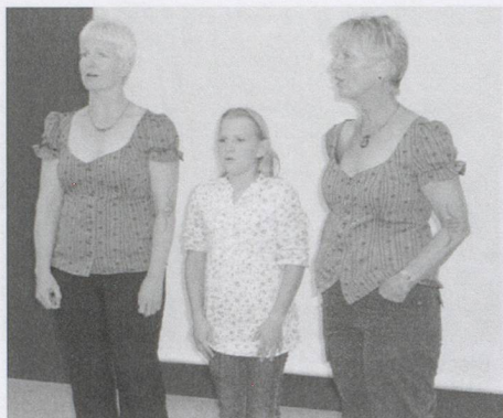
Like mother like daughter