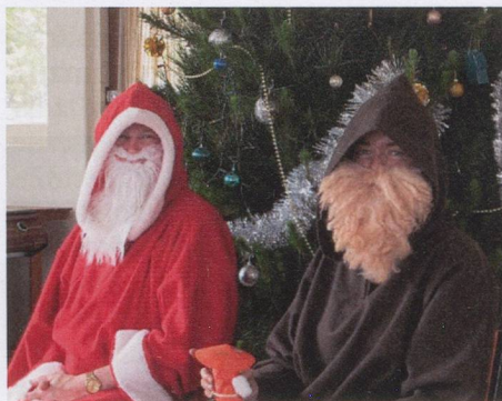
Smiling Samichlaus and Schmutzli

figures with toilet paper rolls when we heard a bell ringing. That was Samichlaus and his friend Schmutzli arriving. They were on foot, as they had left their donkey in a meadow for a rest.