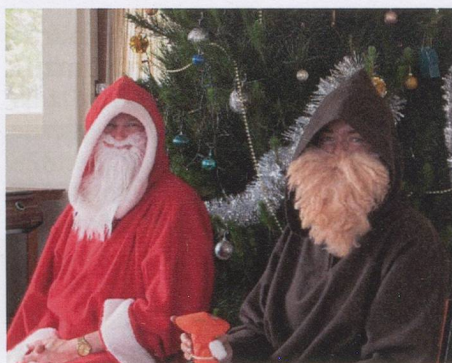
Smiling Samichlaus and Schmutzli

figures with toilet paper rolls when we heard a bell ringing. That was Samichlaus and his friend Schmutzli arriving. They were on foot, as they had left their donkey in a meadow for a rest.