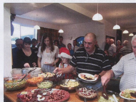
People queuing up for Christmas dinner