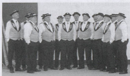
Our great Yodlers