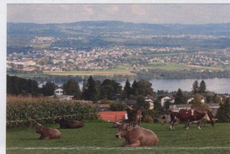
Forch towards Pfannenstiel, Greifensee and Uster in the background

the west, the cantons of Zug and Schwyz to the south and the cantons of Thurgau and St. Gallen to the east. Most of the Lake Zurich is located within the canton.