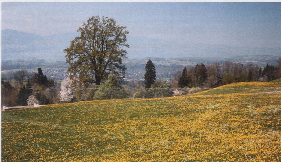
Spring in the Zürcher Oberland

area. The lands to the north and east are more agricultural, but in every part of the canton manufacturing predominates. The canton of Zurich is noted for machinery. Silk and cotton weaving were important in the past, but