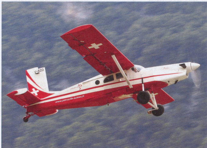
PC-6 Porter Pilatus aircraft

The PC-6 Porter was Pilatus's first aircraft to achieve widespread international success.