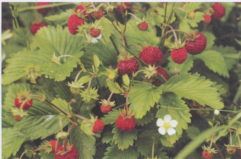
Fragaria vesca –Walderdbeeren

Stone Age. The woodland strawberry was first cultivated in ancient Persia. Its seeds were later taken along the Silk Road towards the far East and to Europe where it was widely cultivated until the 18th century, when it began to be replaced by the garden strawberry, which has much larger fruit and showed