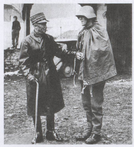
Guisan Inspection Jura 1940

To this day Guisan has something of a cult status. His presence is everywhere; just check the maps of major Swiss cities: Almost all have a Guisan Street, an Avenue General Guisan or a Place General Guisan. And it is very probable that the general's portrait still hangs prominently in some old village bars.