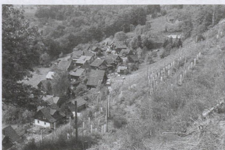
Wienacht-Tobel with vineyard; the AR wine grows here

Everybody knows when Wienacht, Christmas, is - but do you know where it is? Geography was never my strongest subject, but I know where Wienacht is, as I grew up within walking distance of this 'Heritage Site of National Significance'. It is half way between Rorschach and Heiden (whose Biedemeier village around the church square is listed as another heritage site of national significance).