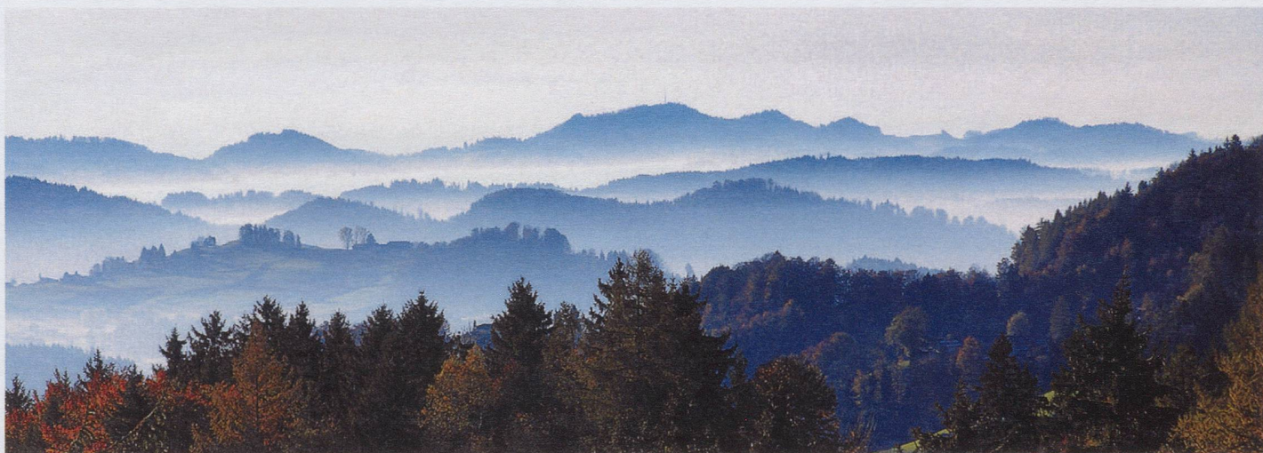
Egg, Speicher Appenzell Ausserrhoden

Herisau was first mentioned in 837 as Herinisauva, and its church is mentioned in 907. In 1084 Herisau was destroyed as part of battles around the monastery in St. Gallen. In 1248 and 1249 the town was destroyed again, this time by the monastery to establish loyalty. Between 1517 and 1518 Herisau managed to buy itself free from the monastery.