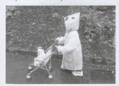
Prepared for weather for ducks...

The weather was not very promising; that is probably why few families showed up. Well, the weather turned out to be better than expected, and the rain gear you see on the picture was actually not necessary!