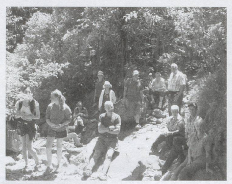
Te Aroha walk

The Family Walk was held on Sunday 30<sup>th</sup> October starting at the Te Aroha Domain. There were about 18 people in total, including two mountain-bikers