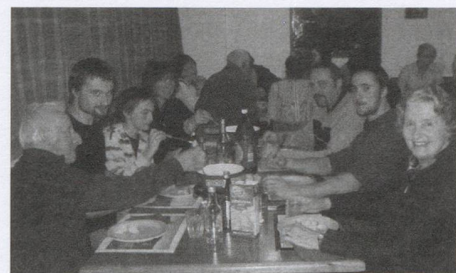
The main medal winners...