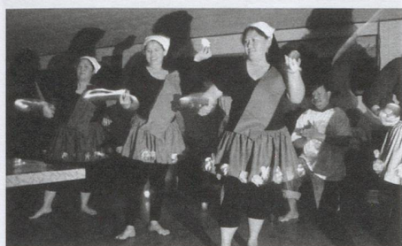
... and a Philipino performance