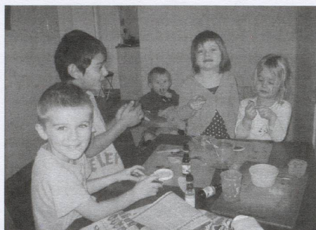
Eating our artwork

20 th July – We had one of our (almost) regular "Krabbel-gruppe" (understand "coffee group") on Wednesday 20 th July. We were four mums and 9 kids, ages ranging from five months to six years.