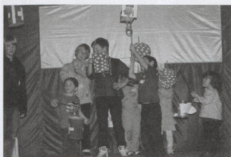
Weiss nicht, ob das von Auckland ist.

feel real with their Lampion - Parade, and their parents who got them all organised.