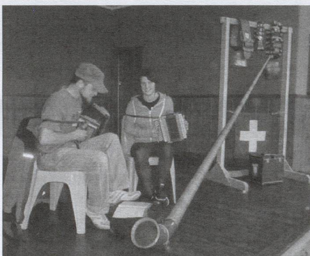
Our young musicians

Again we chose to have our National Day celebration on a Sunday as last year's lunch-time function proved to be very popu- lar. We had about 100 members and friends turn up promptly at the Matangi Hall and after a brief welcome by the president everyone was ready to queue up for their buffet lunch. We had copious supplies of sauerkraut, potatoes, speck, ham and two types of sausages. No one went hungry and most people had a chance to come back for sec- onds. There were lots of com-