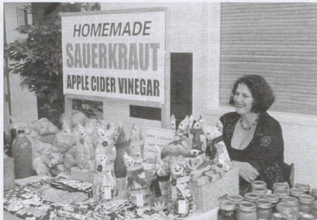
Sauerkraut, Apple Cider and doorstops from the Itens, next to homemade jams