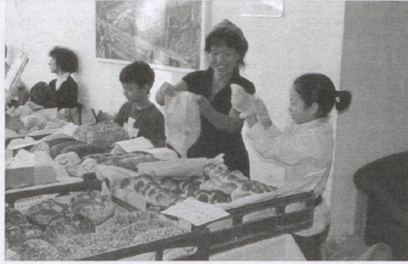
Yummy breads from the Swiss Konditorei Bern

The range of products on offer left nothing to be desired. There was everything from wood carvings, wooden toys, paintings, photographs, posters, handicraft, pottery, carnival masks, t-shirts and bike clothing to secondhand