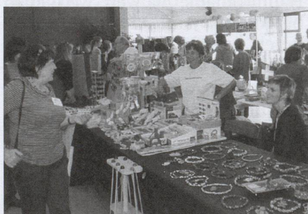
Happy faces all around in the sun filled hall