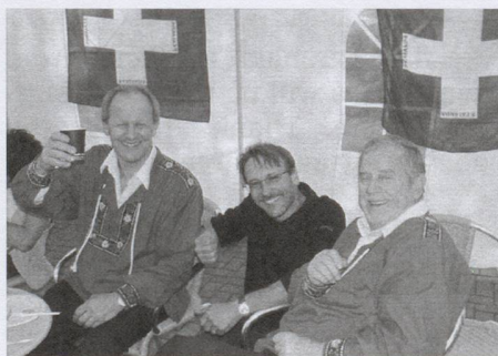
The Feshütte where you find some time to talk to old friends