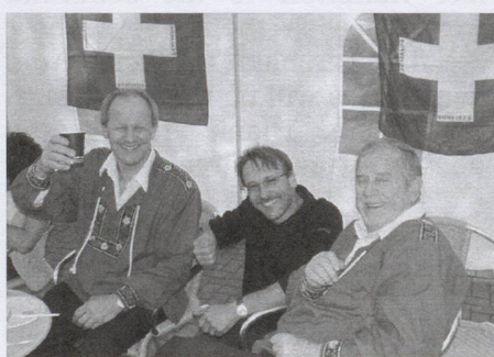
The Festhütte where you find some time to talk to old friends