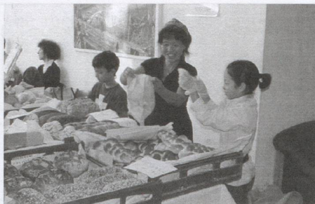
Yummy breads from the Swiss Konditorei Bern

The range of products on offer left nothing to be desired. There was everything from wood carvings, wooden toys, paintings, photographs, posters, handicraft, pottery, carnival masks, t-shirts and bike clothing to secondhand