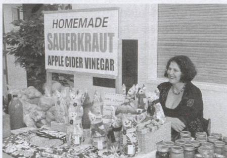
Sauerkraut, Apple Cider and doorstops from the Itens, next to homemade jams