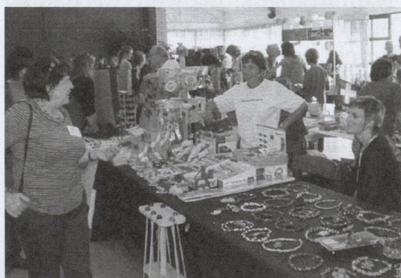
Happy faces all around in the sun filled hall