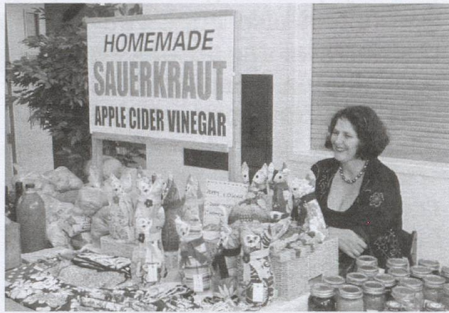
Sauerkraut, Apple Cider and doorstops from the Itens, next to homemade jams