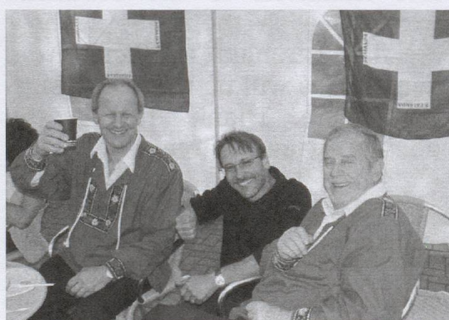
The Feshütte where you find some time to talk to old friends