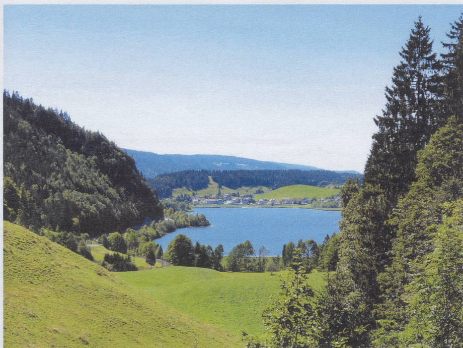
Vallée de Joux

The areas in the southeast are mountainous, commonly named the Vaud Alps. The Diablerets massif, peaking at 3,210 meters,