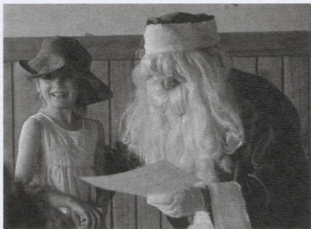
A happy child

greeted by delighted children, parents and friends. In his usual professional way he talked to over 60 children at their own level, brought them lots of joy, and a Santa bag. More than ever