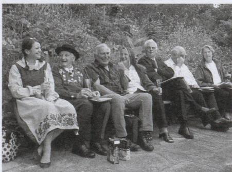
Warming up (with schnapps) while waiting to sing

Sunday, 12 th December: Carol Singing . We'd also had a fine time singing old favourite carols