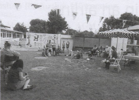
Santa comes to watch the pantomime before he hands out the presents.