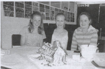
Girls admiring the decorated Gingerbread House before it collapses

Christmas Party for Families was held on Sunday 5 December at the Newstead School. We had a great turnout with lots of families from near and wide. It was another beautiful summer's day so the children could enjoy the huge adventure playground and play games out in the field. For those wanting to do something more creative, there were activities organised inside. Again we had baked Christmas Trees and Gingerbread Men to decorate as well as cards to put together. There was also a Gingerbread House to decorate but this started to collapse before we finished decorating it. Everyone had fun and it also tasted good.