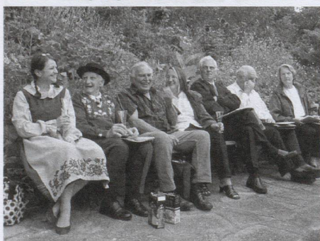
Warming up (with schnapps) while waiting to sing

Sunday, 12 th December: Carol Singing. We'd also had a fine time singing old favourite carols