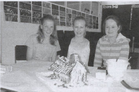
Girls admiring the decorated Gingerbread House before it collapses

Christmas Party for Families was held on Sunday 5 December at the Newstead School. We had a great turnout with lots of families from near and wide. It was another beautiful summer's day so the children could enjoy the huge adventure playground and play games out in the field. For those wanting to do something more creative, there were activities organised inside. Again we had baked Christmas Trees and Gingerbread Men to decorate as well as cards to put together. There was also a Gingerbread House to decorate but this started to collapse before we finished decorating it. Everyone had fun and it also tasted good.