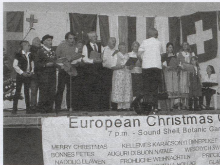
Swiss Choir and German friends performing at the Soundshell