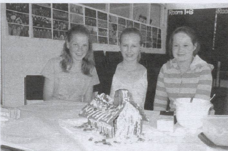
Girls admiring the decorated Gingerbread House before it collapses

Christmas Party for Families was held on Sunday 5 December at the Newstead School. We had a great turnout with lots of families from near and wide. It was another beautiful summer's day so the children could enjoy the huge adventure playground and play games out in the field. For those wanting to do something more creative, there were activities organised inside. Again we had baked Christmas Trees and Gingerbread Men to decorate as well as cards to put together. There was also a Gingerbread House to decorate but this started to collapse before we finished decorating it. Everyone had fun and it also tasted good.