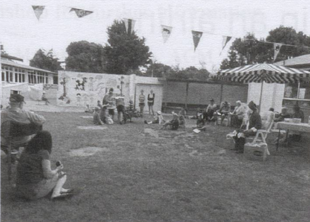
Santa comes to watch the pantomime before he hands out the presents.