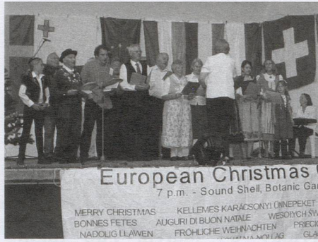
Swiss Choir and German friends performing at the Soundshell