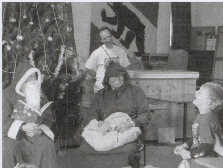
Samichlaus, Schmutzli and friends