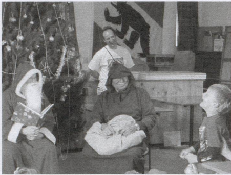
Samichlaus, Schmutzli and friends