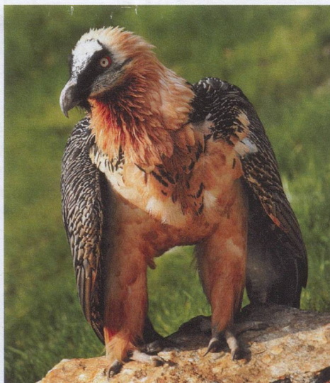
Bearded vulture – Lämmergeier

The giant bearded vulture, Lämmergeier, is a huge bird, with a wing span of 2.7 meters - even larger than a golden eagle. It takes its name from