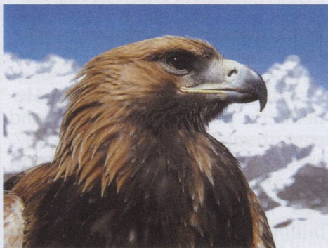
Golden eagle – Adler

The golden eagle is one of Switzerland's biggest birds of prey, with a wing span which can go up to a little more than 2 meters. It feeds mainly off smaller birds and mammals, especially hares, marmots and foxes. Eagles have excellent eyesight: it has been shown that they can see a hare at a distance of one kilometer. They also eat carrion - often the victims of avalanches.