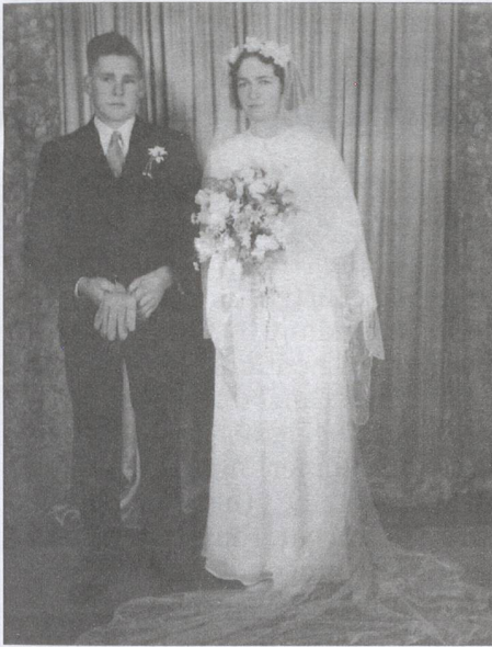
Bride and groom