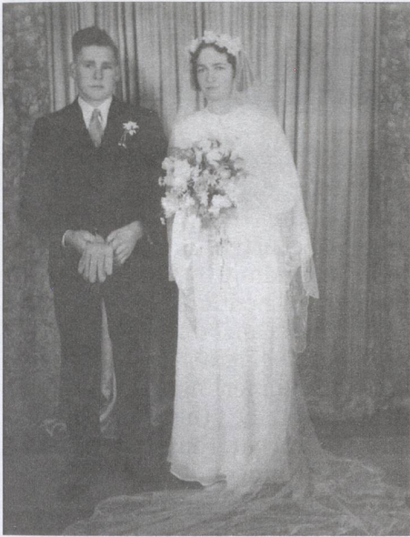
Bride and groom