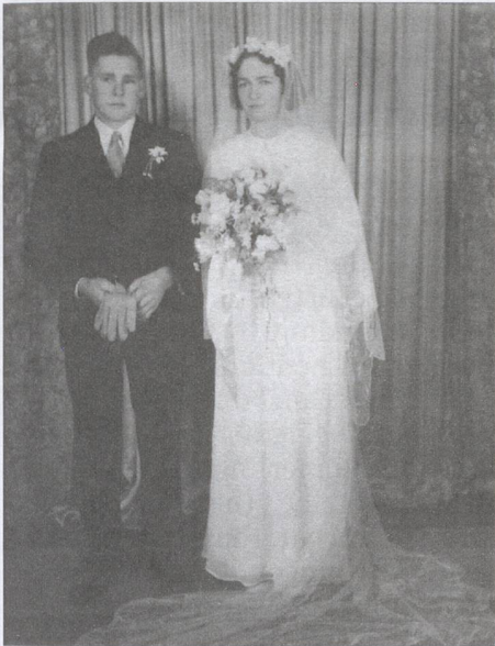
Bride and groom