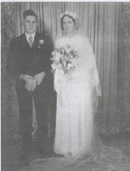
Bride and groom