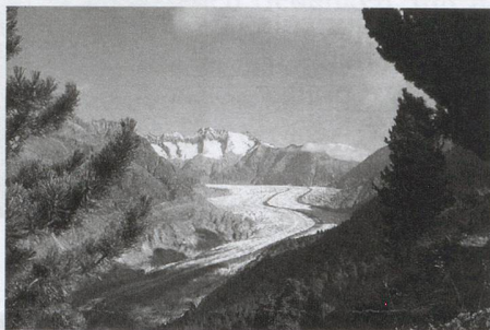
The 23.6km long Aletsch glacier, extending over 120 square kilometres, is the largest river of ice in the Alps

ferent. The inhabitants of the alpine villages of Fiesch and Fieschertal suffered countless natural disasters, mostly avalanches and floods from glacial lakes.