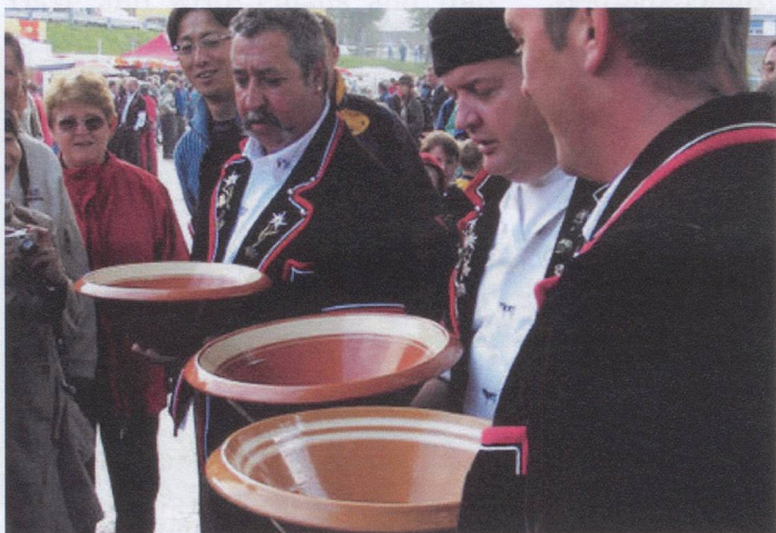
Talerschwingen is a serious affair

Talerschwingen became popular in Appenzell and Toggenburg about 100 years ago. Thereby a five-franc piece is rolled around the inside of an earthenware bowl, which is held on the palm of one hand and slowly rotated. Three bowls of different diameter, used simultaneously, produce a sound reminiscent of distant cowbells, which harmonises well with yodeling.