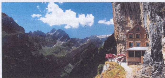
Berggasthaus Aescher - Wildkirchli

Death during hibernation was a common end for cave bears, mainly befalling specimens that failed ecologically during the summer season through inexperience, sickness or old age. Some cave bear bones show signs of numerous different ailments, including fusion of the spine, bone tumours, cavities, tooth resorption, osteomyelitis, rickets and kidney stones. Paleontologists doubt adult cave bears had any natural predators, save for pack hunting wolves and cave hyenas which would probably have attacked sick or infirm specimens.