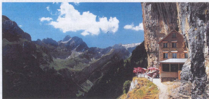
Berggasthaus Aescher - Wildkirchli

Death during hibernation was a common end for cave bears, mainly befalling specimens that failed ecologically during the summer season through inexperience, sickness or old age. Some cave bear bones show signs of numerous different ailments, including fusion of the spine, bone tumours, cavities, tooth resorption, osteomyelitis, rickets and kidney stones. Paleontologists doubt adult cave bears had any natural predators, save for pack hunting wolves and cave hyenas which would probably have attacked sick or infirm specimens.