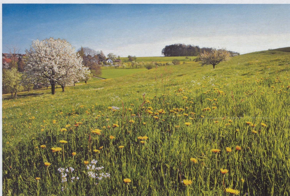
Tafeljura near Anwil

Basel-Landschaft, together with Basel-Stadt, formed the historic Canton of Basel until they separated following an uprising in 1833.