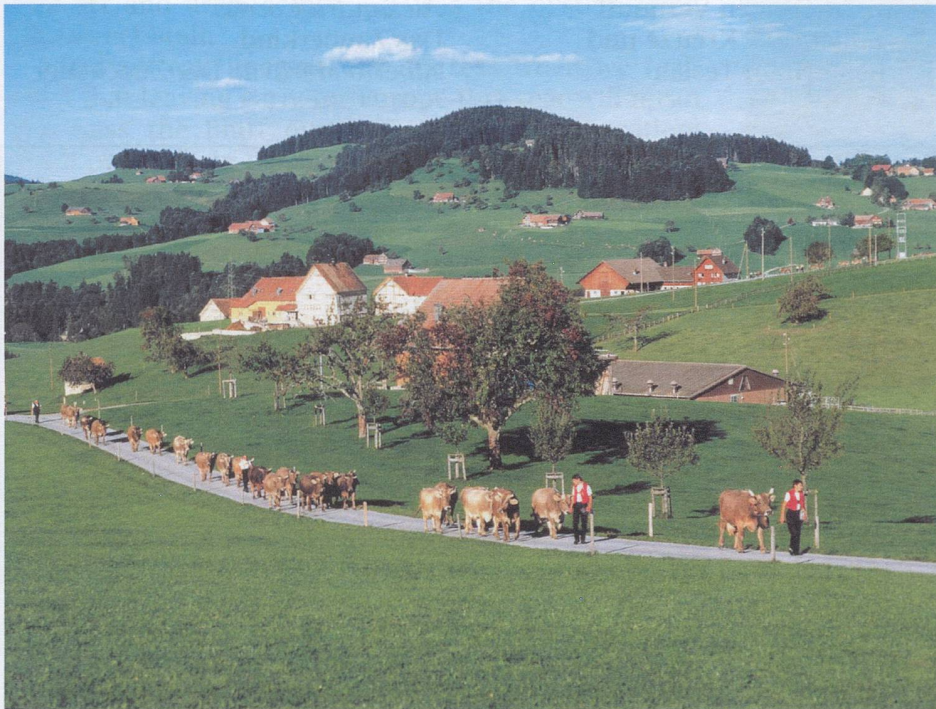
Pastoral landscape of Appenzell Innerrhoden

The name Appenzell means "cell (i.e. estate) of the abbot". This refers to the Abbey of St. Gall, which exerted a great influence on the area. By the middle of the 11th century the abbots of St Gall had established their power in the land later called Appenzell, which, too, became thoroughly germanized; its earlier inhabitants were probably romanized Raetians.