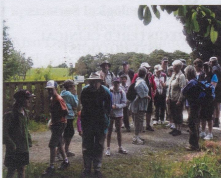
The group of 32 heading off for the walk