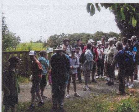
The group of 32 heading off for the walk