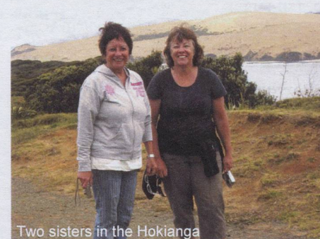
Two sisters in the Hokianga