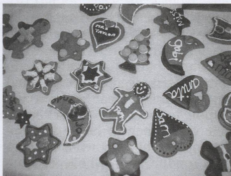
Yummy Christmas gifts

Läbchueche decorating (Yummy Swiss version of Gingerbread) Sunday 21 November, 10am – 2pm Waitoki Hall, Waitoki. Edith from the Swiss – Bliss chocolate factory has kindly