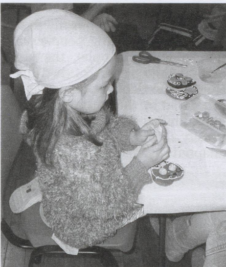
Fun for all ages

decoration for your Christmas tree or a unique gift, join us and create your own Läbchueche. A pot full of melted chocolate, marzipan, flowers and hearts made out of sugar as well as boxes and decoration material will be provided.