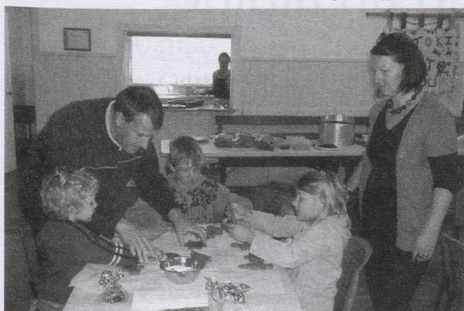
Getting ready for Christmas

Children AND grownups, if you would like a very special