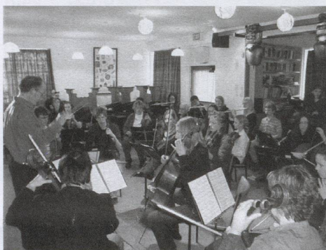
Upper Hutt Music Centre Orchestra