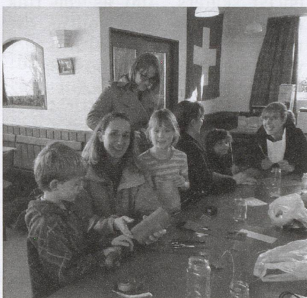
So many 1st August lampions!