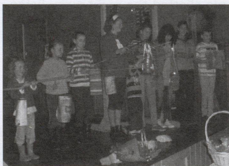
Children after the Lampion Parade

Following lunch, the adults listened to the speech from the Federal President and sang the Swiss National Anthem, whilst the children queued up outside ready for the Lampion Parade. The lights were then dimmed and the children paraded in and sang