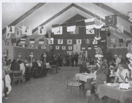
Beautifully decorated hall and choir

Here a couple of photos. For more, and to see the hall in its full glory, follow the link on www.swiss.org.nz/auckland