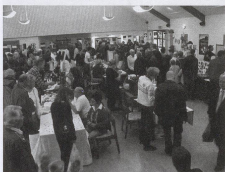
The hall was full

The only thing we didn't know in advance was how many interested persons would find the way out to Penrose. Every little town, village and even suburb has its own farmers' market nowadays (even if there are no farmers left there) so that we were wondering whether people would feel surfeited with markets.