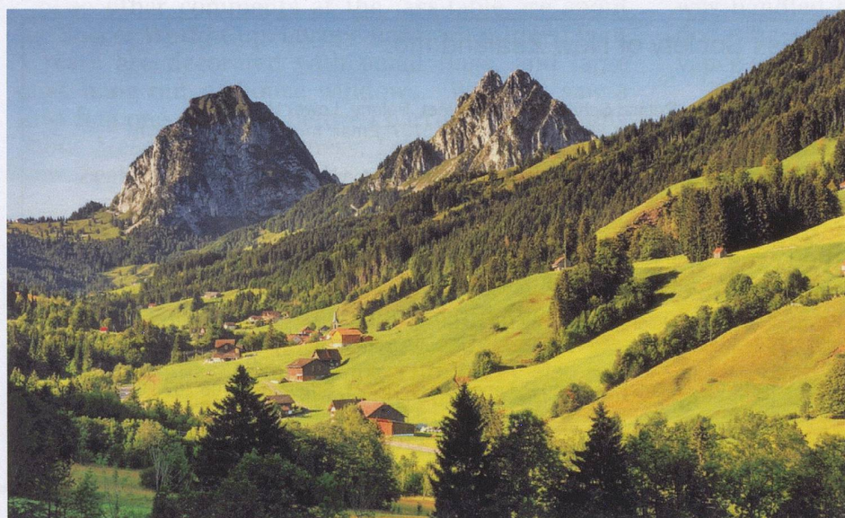
Grosser and Kleiner Mythen near Schwyz

elevation is the Bös Fülen at 2,802m. Although not as high, the summits of the Rigi massif (Kulm, 1,798m, and Scheidegg, 1,665m) are probably the most famous mountains within the borders of the canton. The area of the canton is 908km 2 . The population of the canton (as of 31 December 2008) is almost 150,000. About 17.2% of the population are foreigners.