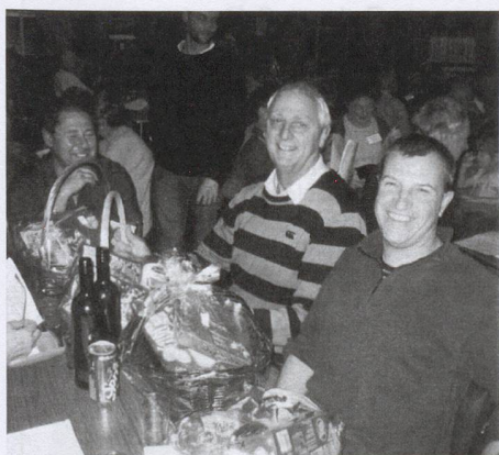
Jolly good fellows

their guests. The proceedings, the AGM and the Society games between Auckland and Wellington, all took place in the Taranaki