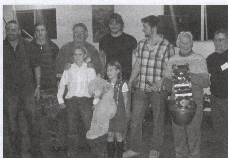
Wellington winners receiving the cow bell

The evening entertainment was varied and well appreciated, the Hawera brass band that en-