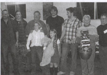
Wellington winners receiving the cow bell

The evening entertainment was varied and well appreciated, the Hawera brass band that en-