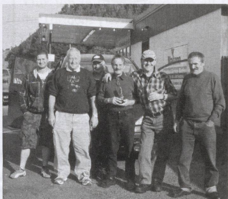
Hi Taranaki, here comes Auckland

A Weekend at the Society AGM in Taranaki. Some people find AGMs boring. Fourteen Auckland Swiss Club members did not think so. They found their way to the farming province, which was green and wet and, as usual, very hospitable to