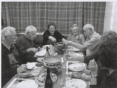
Lost a piece of bread?