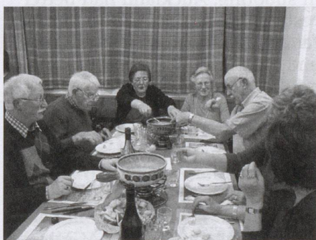
Lost a piece of bread?