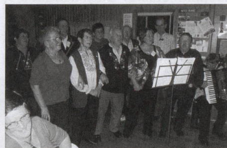
The Taranaki Swiss Club Choir