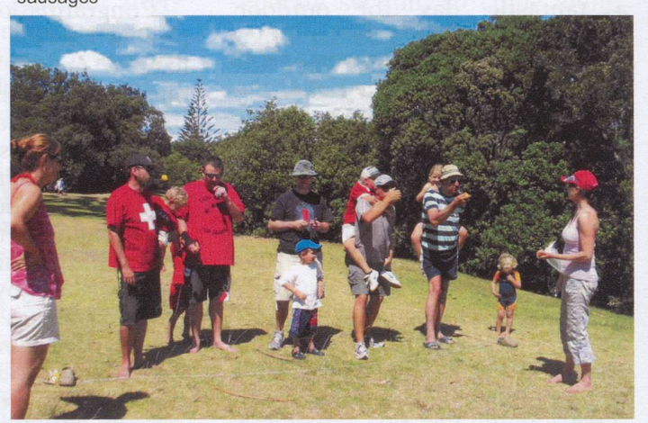
Beach party group