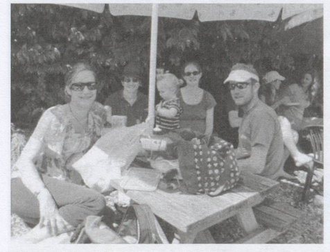
Parents watching their children play

Sunday 21 February: Family Day and Picnic at the Jäggi Park - What a glorious day it was! The weather was perfect, and many families went for the drive to the