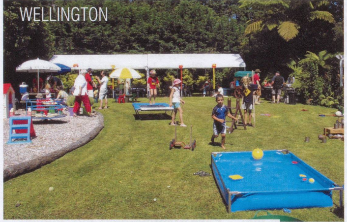
The wonderful playground at Jäggi Park