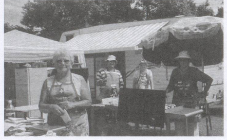
Part of the team preparing the sausages which were enjoyed by all

The smell of barbequed cervelas and bratwurst was filling the air ... and did we go through some kilos of the delectable