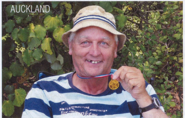
Our presi won gold