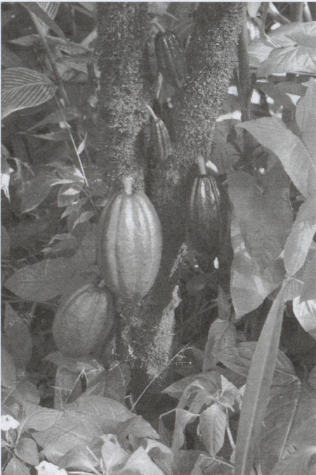
The cocoa tree

The Swiss non-governmental organisation Berne Declaration has launched a campaign to encourage the country's chocolate producers to do more to ensure the cocoa they buy comes from ethical sources.