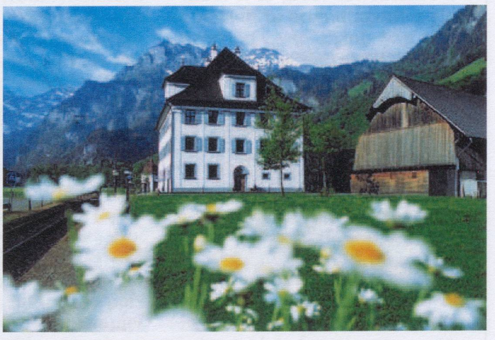
Herrenhaus in Engelberg