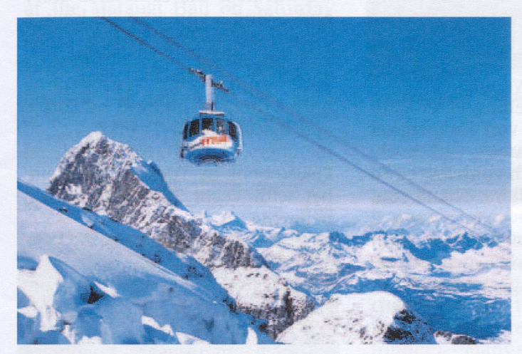
Revolving cable-car from Engelberg to Mt. Titlis

Engelberg is a charming village located in Central Switzerland, at the foot of Mount Titlis. It draws tourists for its perfect mix of culture and sports. Winter enthusiasts as well as friends of summer sports get their share in Engelberg.