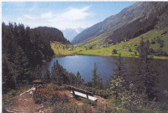
Golzerensee and the beautiful Maderanertal

This east-west running side valley of the Reuss valley is another quite famous mineral location in Switzerland. The name of the Maderaner valley goes back to a noble family who mined in the 16th and 17th centuries the iron ores at the Windgällen locality. After the Madran family diminished in 1631, the mining came to an end. In the 19th century, some wanted to start it again but the people of Silenen prohibited the use of wood out of the forest, a quite remarkable move at that time.