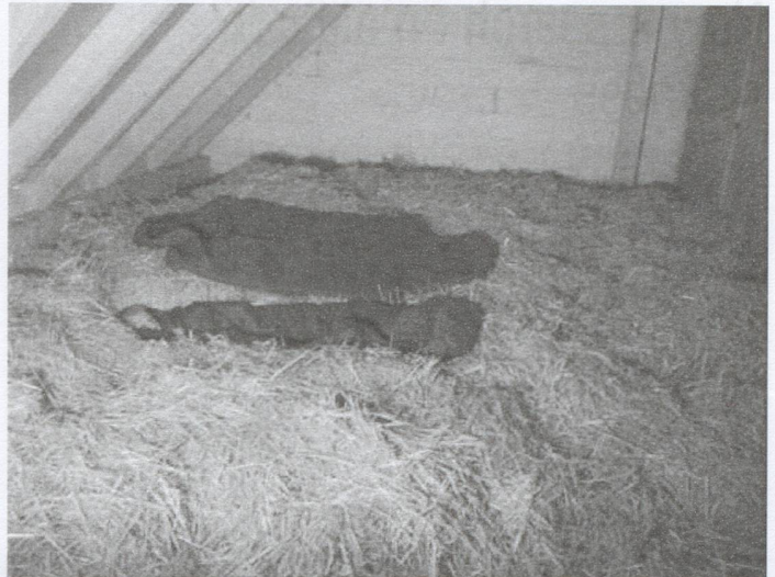
Sleeping on straw

The practice of "FKK" (which stands for "free body culture") is a serious pursuit in Germany. Nudism was already popular at the beginning of the 20th century. It regained popularity after the war, especially in communist East Germany. Since reunification, German FKK fans of all ages sunbathe in the nude